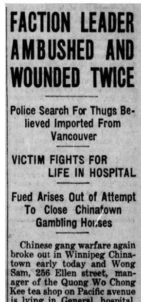
Winnipeg Tribune, November 4, 1931